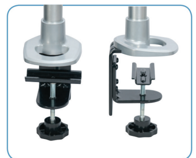
Clamp and grommet mount